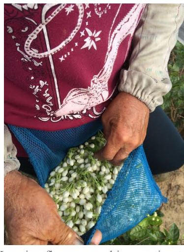
Jasmine flowers used in scenting tea

Terroir Influence : Jasmine Pearl is now produced in several areas in China. Fujian leaf generally produces lot of 'down' or 'silvery hair' that is known to give a smooth buttery texture to the brew. Yunnan leaf is generally bold with more astringency.